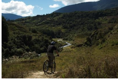
The road down hill