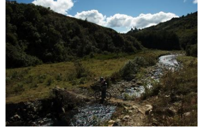
Crossing the river