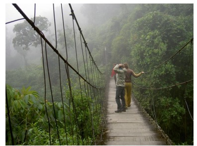
Suspension bridge in Incachaca